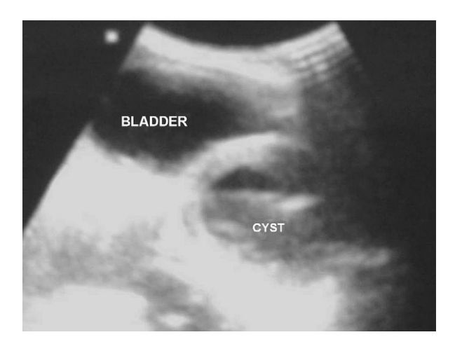
Figure 5 Müllerian cyst compressing the bladder.