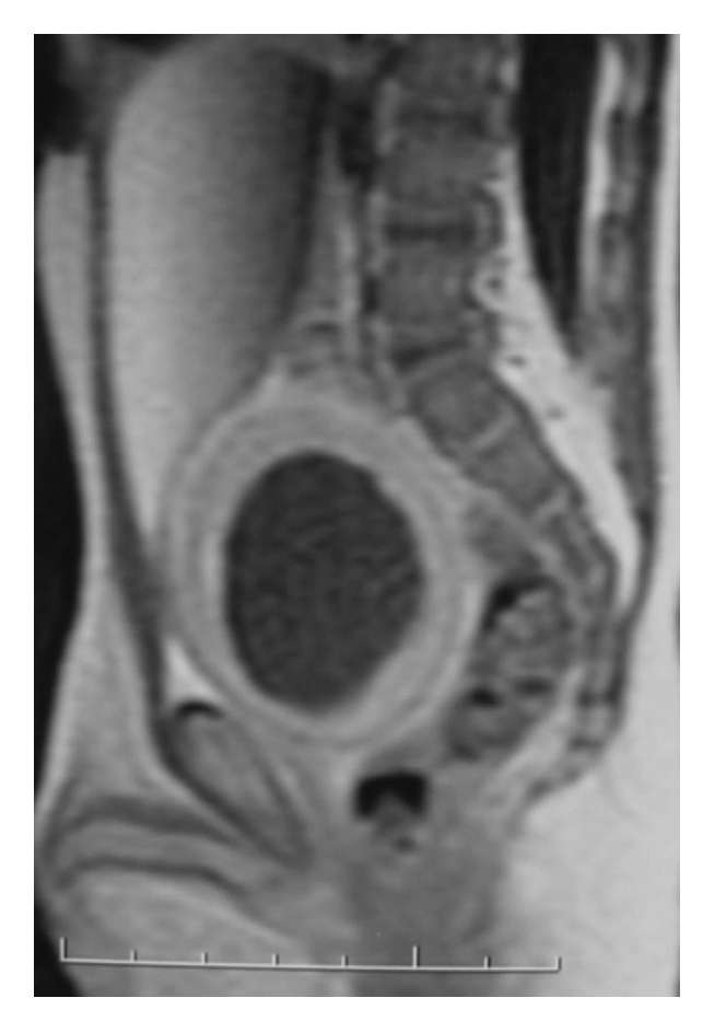
Figure 3 MRI showing the Müllerian cyst.

for 8 days. Histopathological exam of the cyst also revealed an unspecific chronic inflammatory process. Currently, 3 years after the surgical procedure, the patient is well, with a normal urinary flow.